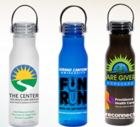
Clear Translucent Royal Translucent Black with Wrap Imprint

Setup Charge: 60.00 (G). Price Includes: Up to a full color process imprint on one side, both sides or a full wrap (exact color matches are not possible). If location is not specified, factory prints on one side only. PMS Color Match: Exact color matches are not possible. Email Proof: 7.50 (G), add 2 days to production time. Repeat Setup Charge: 32.50 (G), Production Time: 5 Days up to 500 Pcs, 7 Days for 500+. Packaging: Bulk, fully assembled. Meets FDA requirements.