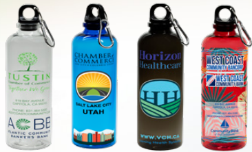
Clear Translucent Royal Translucent Black Translucent Red with Wrap Imprint