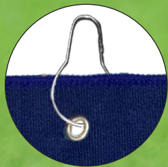
Features Sturdy Metal Grommet and Clip