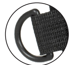
Dual bottom rings allow for right or left shoulder carry