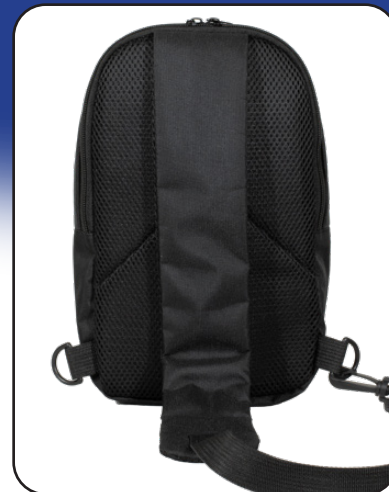
Back panel and strap feature thick padded mesh for a comfortable carry