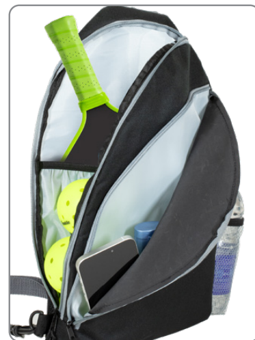
Main Compartment Holds Two Pickleball Paddles and Other Sports Gear with a Spacious Front Pocket. Content Not Included.