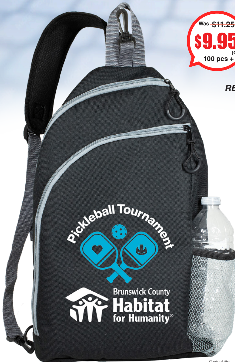
Content Not Included.