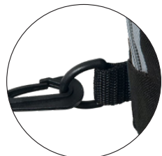
Bottom Side Loops for Carrying on Right or Left Shoulder