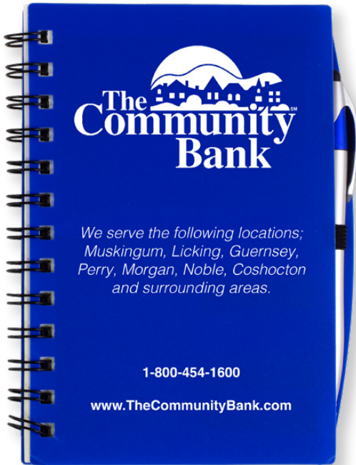
#9216 Available Colors ■ Red ■ Black ■ Navy