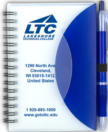
#9210 Available Colors ■ Red ■ Black ■ Navy