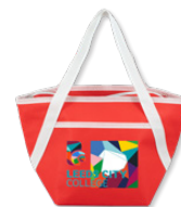
RED Shown with 4 Color Process Imprint*