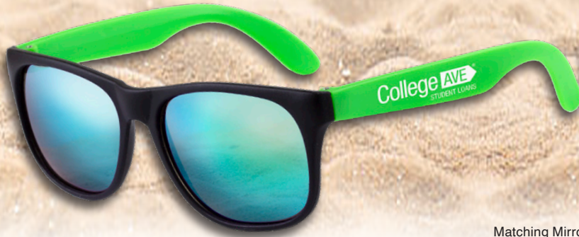
#SG102 "NEWPORT TINT" Colored Mirror Tint Lens Sunglasses with Matte Frame