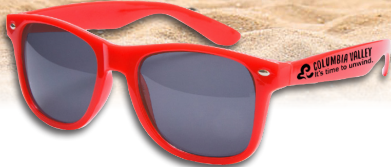
#SG101 "CORONADO COOL" High Gloss Frame Sunglasses