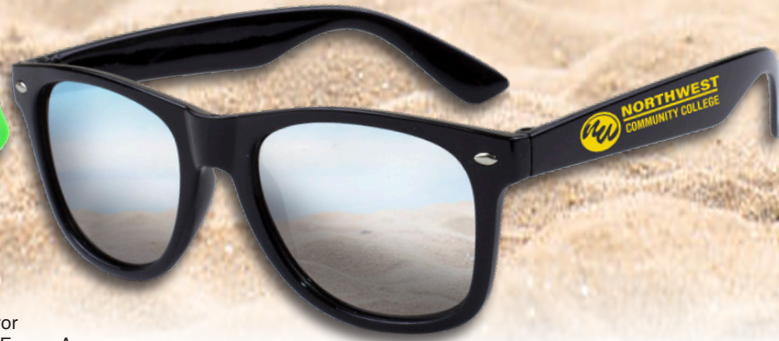
#SG103 "CLAIREMONT" Colored Mirror Tint Lens Sunglasses with High Gloss Frame