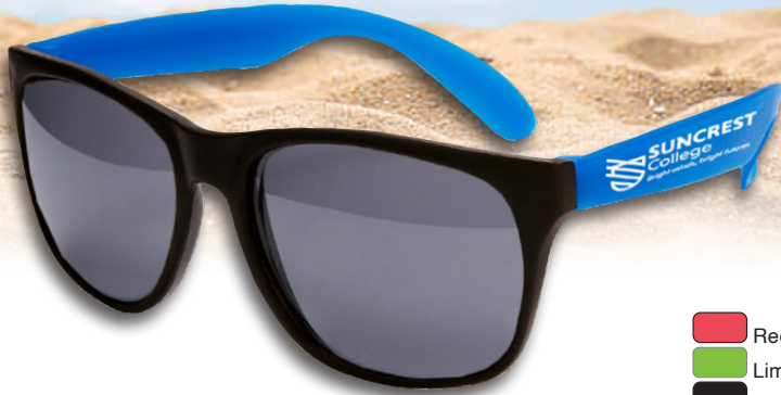
#SG100 "NEWPORT EVERYDAY" Matte Frame Sunglasses