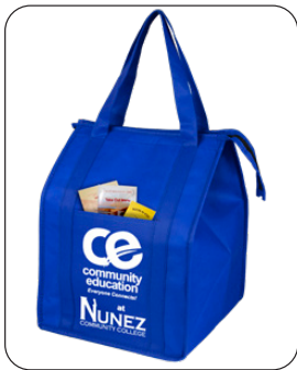
Shown Fully Zipped Up