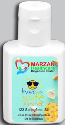
Shown with Multicolor Vinyl Label* add .10 (G) running charge