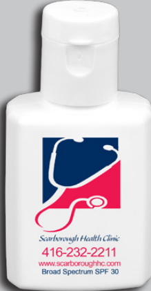
Shown with Spot Color Print

BROAD SPECTRUM SPF 30 SUNSCREEN ON SALE NOW!