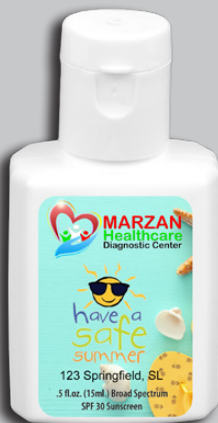
Shown with Multicolor Vinyl Label* add .10 (G) running charge