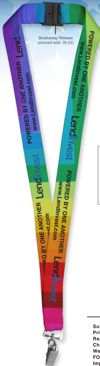
#LARIS Shown with Standard Bulldog Clip Attachment