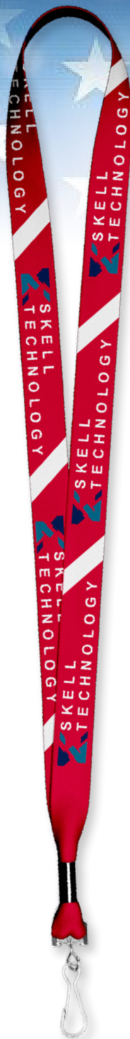
#LA34RI Shown with Standard Swivel Clip Attachment