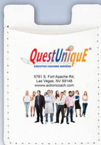
Shown with Optional Full Color Imprint* add .35 (G)