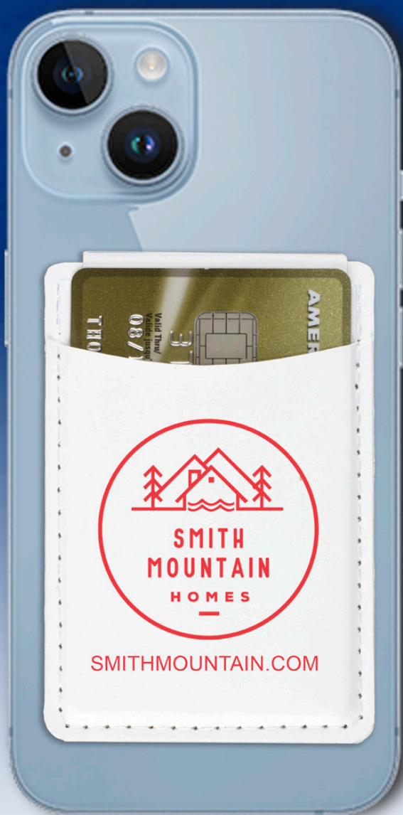
Shown with One Screen Color Imprint