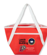
RED Shown with 4 Color Process Imprint*