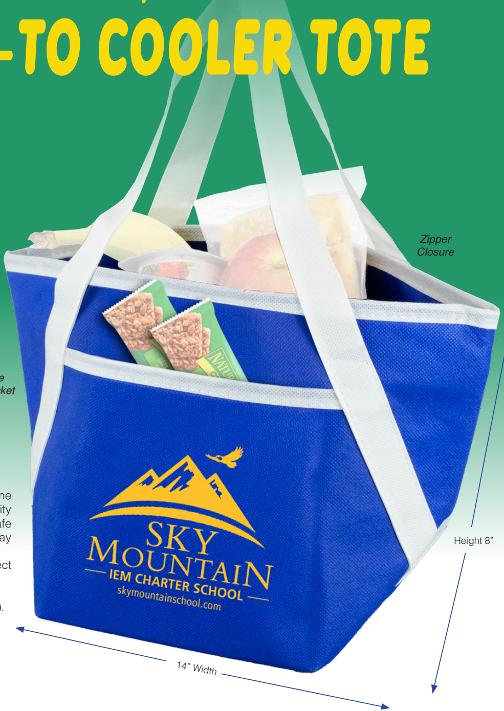
7" Large Front Pocket