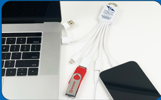
STANDARD USB AND TYPE C EXPANSION HUBS