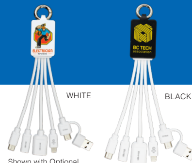
Shown with Optional Full Color Imprint*

Specify Promo #E5105 to receive special pricing at time of order placement as it cannot be applied later. This offer may not be combined with any other promotion, discount, coupon and/or special column pricing. Expires 8/31/2025.