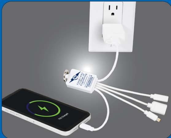
CONVENIENT WAY TO CHARGE YOUR DEVICES