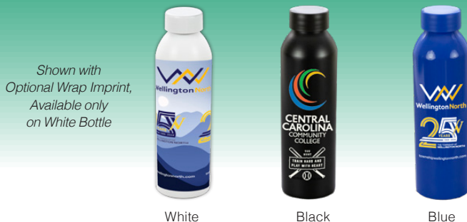
Available Bottle Colors

Shown with Optional Wrap Imprint, Available only on White Bottle