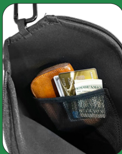
Hidden Inside Pocket