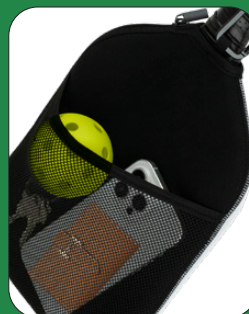
Backside Mesh Pocket