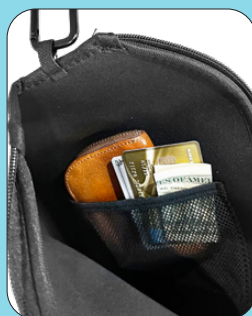
Hidden Inside Pocket