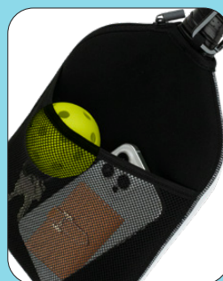
Backside Mesh Pocket