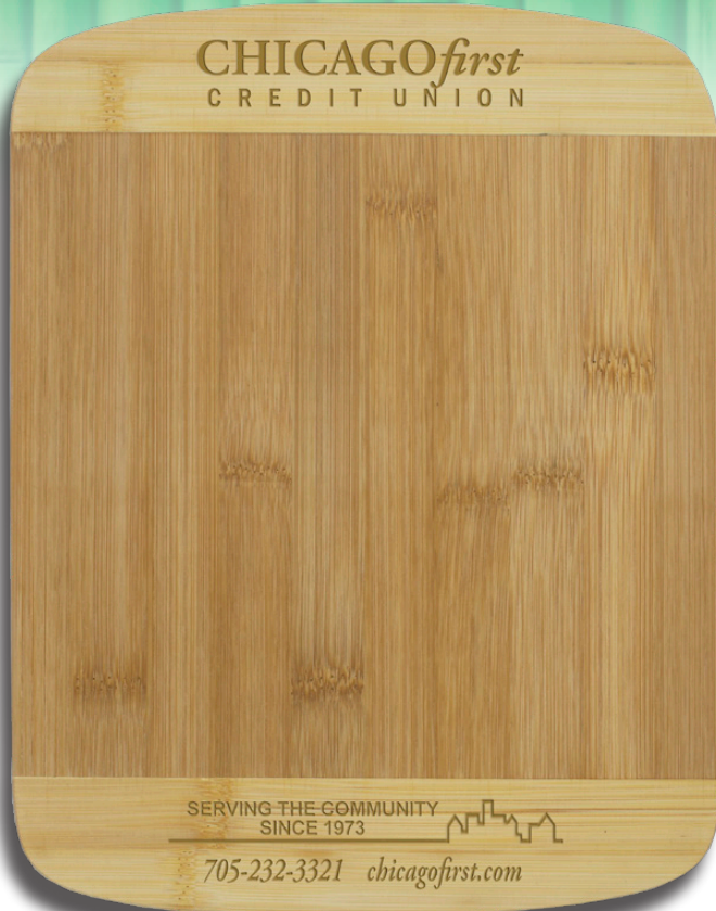
Shown with Optional Second Location Imprint Area

Pricing includes a Laser Engraved Imprint in one location. Meets FDA Standards.