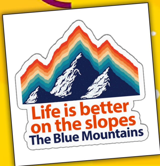
Item #STK9 9 square inches