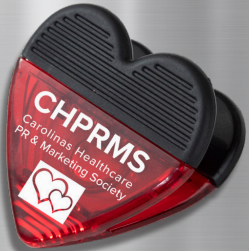
#5037 "CORAZON" HEART SHAPED

Size: 2-3/4" W x 2-3/4" Imprint: 2-1/4" W x 1-1/2" H Weight: 12 lbs / 100 pcs