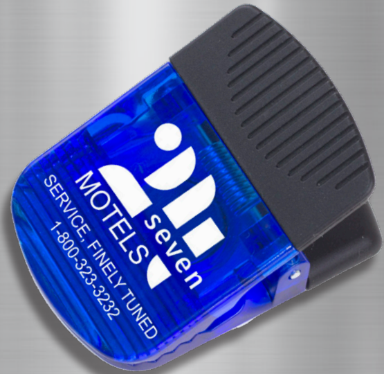
#5035 "CLIPPIE JUMBO"

Size: 2" W x 2-3/4" H. Imprint: 1-5/8" W x 1-1/2" H. Weight: 13-1/2 lbs / 100 pcs