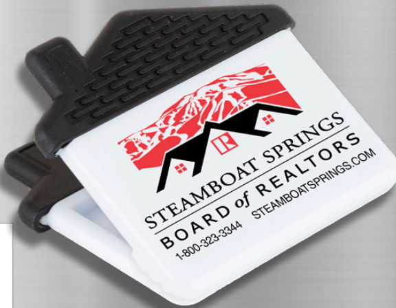
#5036 "THE HOUSEMATE" HOUSE SHAPED