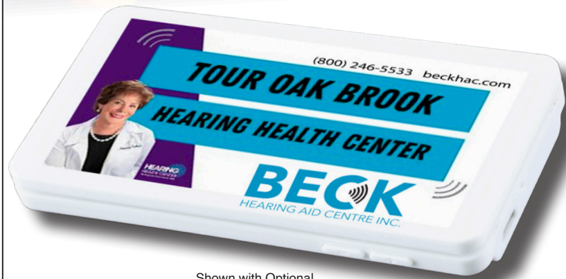
Shown with Optional Photolmage® imprint add .35 (G) running charge

Product Size: 4" W x 2" H Imprint Area: 3-3/4" W x 1-3/4"H Material: Lithium Battery/PVC and ABS plastic components.