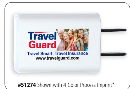
#51274 Shown with 4 Color Process Imprint*

UL File #E476677, XRN Series – The USB Wall Charger and all of its components, standards and performance comply with the rigorous standards of the UL, the premier product safety, certification and testing laboratory in the World.