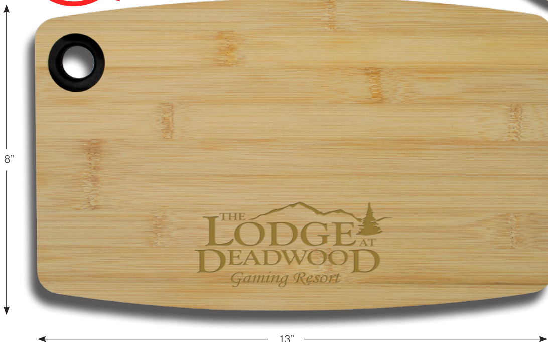
Hanging or Serving Thumb Hole