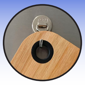
Hanging or Serving Thumb Holes

Bamboo is a highly sustainable, renewable and durable plant that can grow to full size in as few as 3-4 months compared to trees which may take up to 30 years to grow.