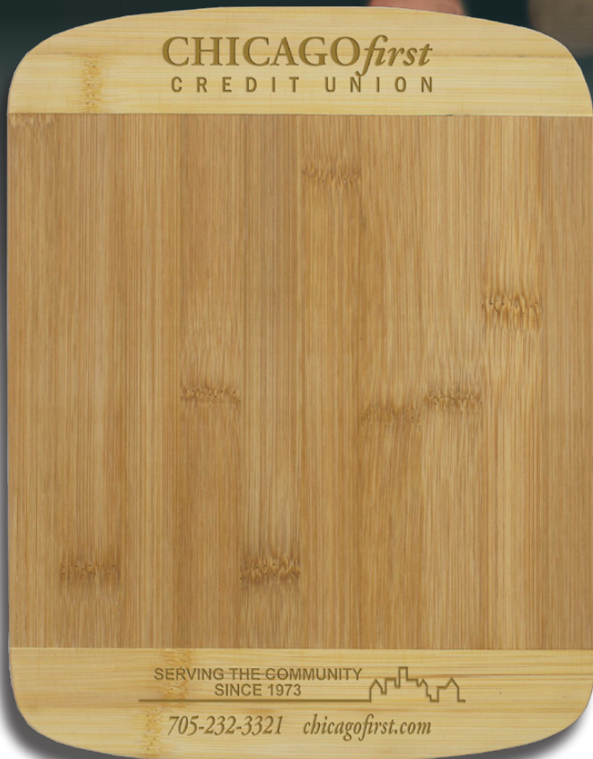
Shown with Optional Second Location Imprint Area

Pricing includes a Laser Engraved Imprint in one location. Meets FDA Standards.