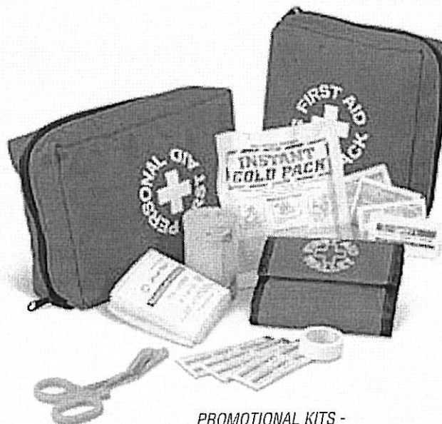
PROMOTIONAL KITS - WALLET, SAFE PACK, PERSONAL