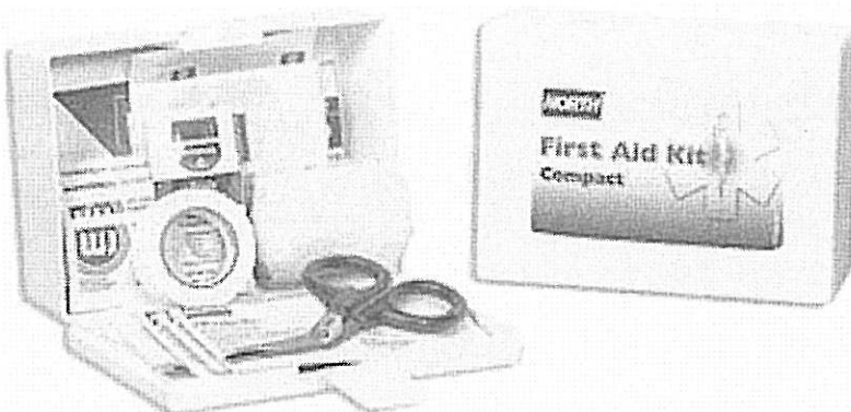
019733-0020L COMPACT KIT