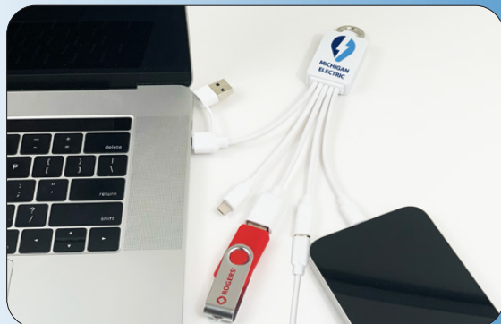
STANDARD USB AND TYPE C EXPANSION HUBS