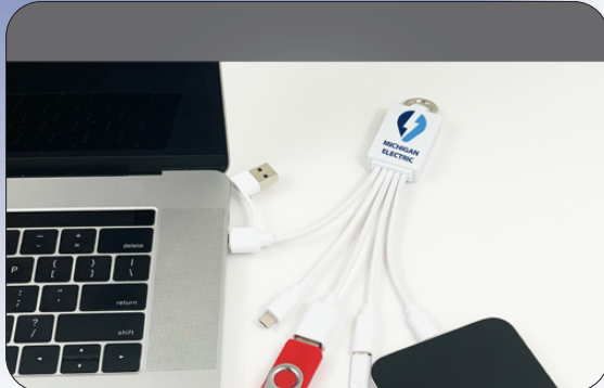
STANDARD USB AND TYPE C EXPANSION HUBS