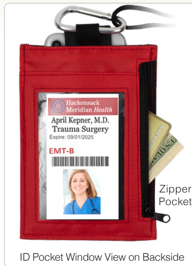
ID Pocket Window View on Backside