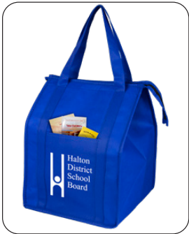
Shown Fully Zipped Up