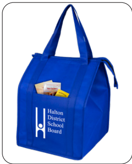
Shown Fully Zipped Up