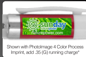
Shown with PhotoImage 4 Color Process Imprint, add .35 (G) running charge*

These pens feature an intense white light. The plunger at the top of the pen activates the light and a simple twist of the barrel extends the writing tip.