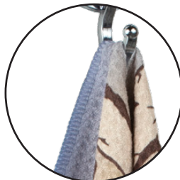
Slit for hanging