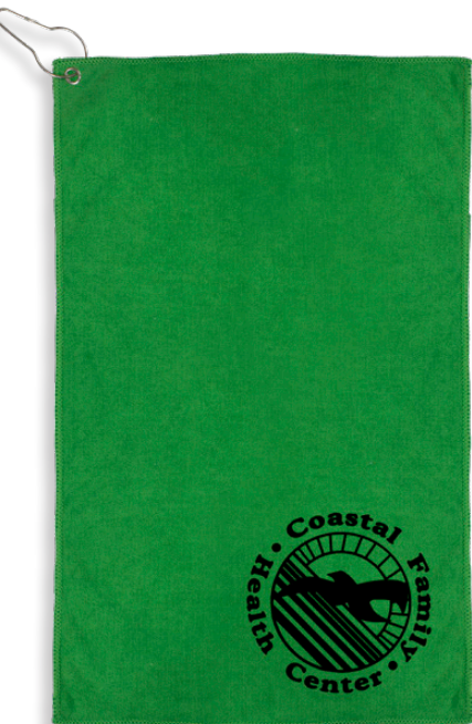
#5150 "THE IRON"

Size: 12" W x 18" H Imprint Area: 5" x 5" Bottom Right Corner Optional Imprint Area: 10" x 12" Centered.