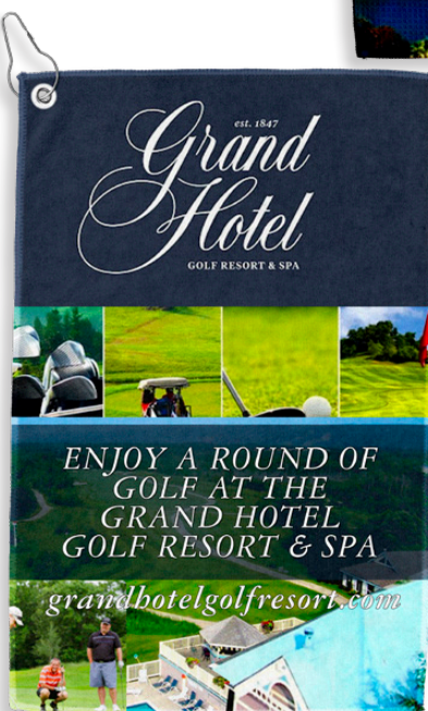
#5150HT "FULL COLOR IRON"

Size: 12" W x 18" H Imprint Area: 12" x 18" full bleed on White Cloth