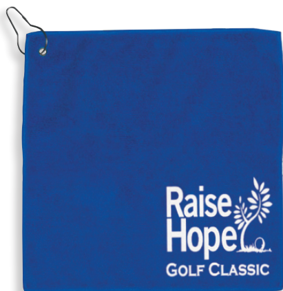
#5130 "THE WEDGE"

Size: 12" W x 12" H. Imprint: 5" W x 5" H (Lower Corner of Diamond) Optional Imprint Area: 10" W x 10" H Centered.