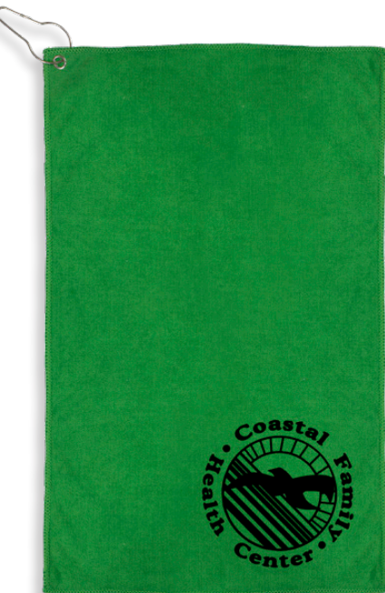
#5150 "THE IRON"

Size: 12" W x 18" H Imprint Area: 5" x 5" Bottom Right Corner Optional Imprint Area: 10" x 12" Centered.