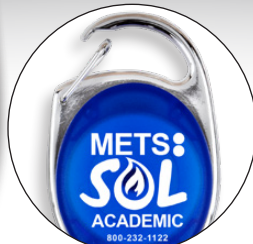
Carabiner style clip for belt loops and bags