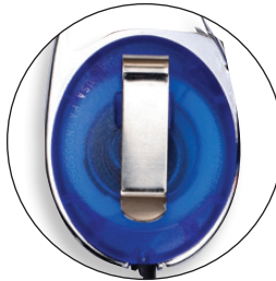
Metal Slip Clip Designed For Scrubs & Uniforms