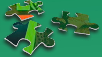
Complete Puzzle picture on front of pouch