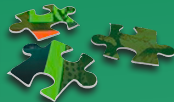
Complete Puzzle picture on front of pouch