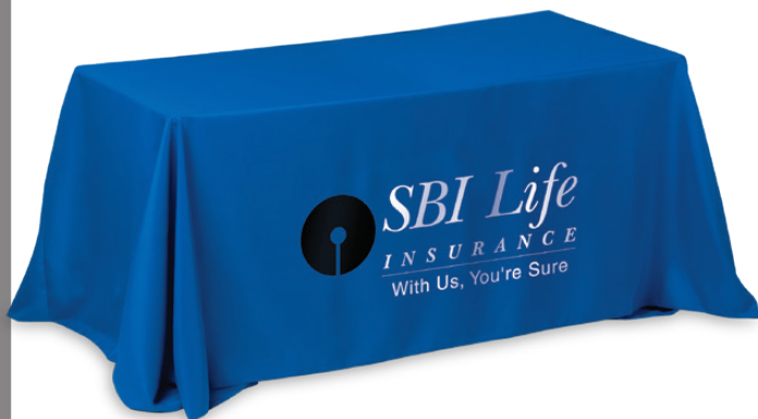
6' Table - 72" x 30" top with 29" drop on all 4 sides. Overall Size: 88" x 130" Fits Table Size: 6' x 4' sides.