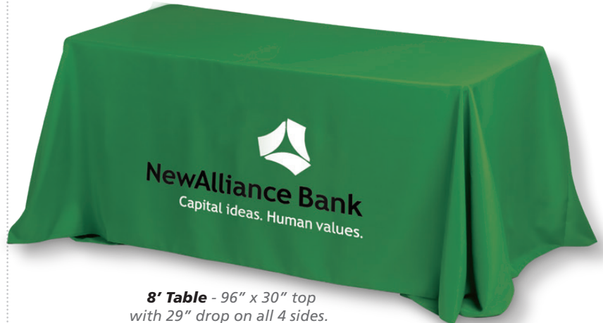
8' Table - 96" x 30" top with 29" drop on all 4 sides. Overall Size: 88" x 154" Fits Table Size: 8' x 4' sides.