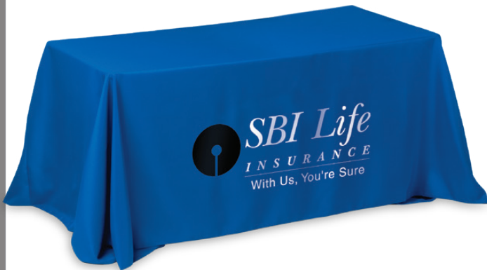
6' Table - 72" x 30" top with 29" drop on all 4 sides. Overall Size: 88" x 130" Fits Table Size: 6' x 4' sides.