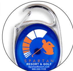
Carabiner style clip for belt loops and bags