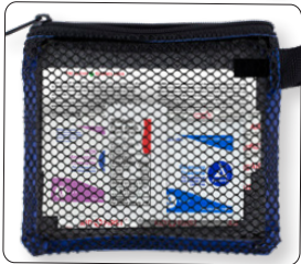
Mesh Fabric Backside