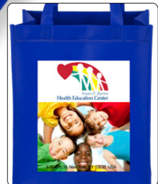
Shown with Optional Full Color Imprint*

Weight: 9 Lbs / 100 Pcs. Material: 90GSM Non-Woven Polypropylene. Reusable and recyclable.