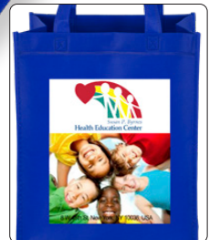
Shown with Optional Full Color Imprint*

Weight: 9 Lbs / 100 Pcs. Material: 90GSM Non-Woven Polypropylene. Reusable and recyclable.