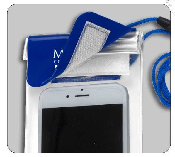
Triple-Safety Seal - Two Fastener strips and an extra thick hook and loop closure