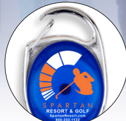
Carabiner style clip for belt loops and bags.