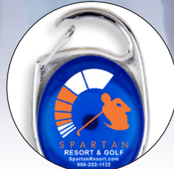
Carabiner style clip for belt loops and bags.