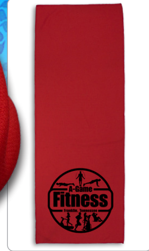
Imprint Area: 9" W x 9" H on either end