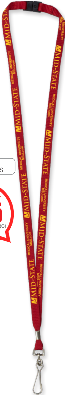
#LA38BA-IS 3/8" LANYARDS