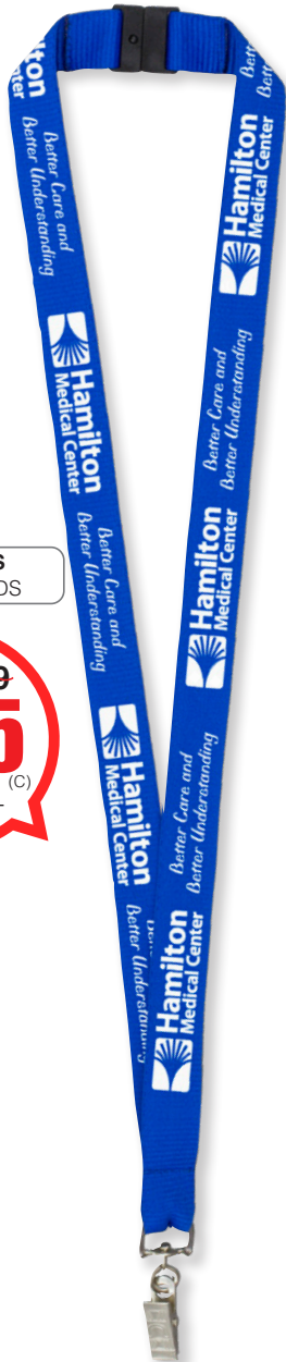
#LA34BA-IS 3/4" LANYARDS