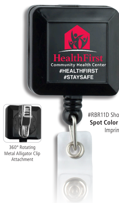
#RBR11D Shown with Spot Color Direct Imprint

Retractable Badge Reel and Badge Holder with Metal 360° Rotating Alligator Clip Attachment (Spot Color or Full Color Imprint)