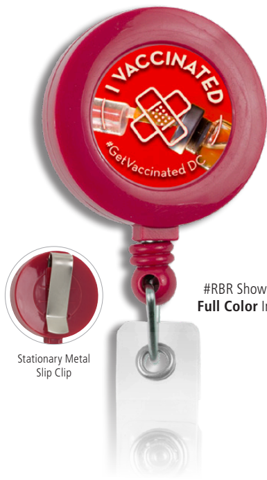
#RBR Shown with Full Color Imprint*

Retractable Badge Reel and Badge Holder with Metal Slip Clip Attachment (Spot Color or Full Color Imprint)