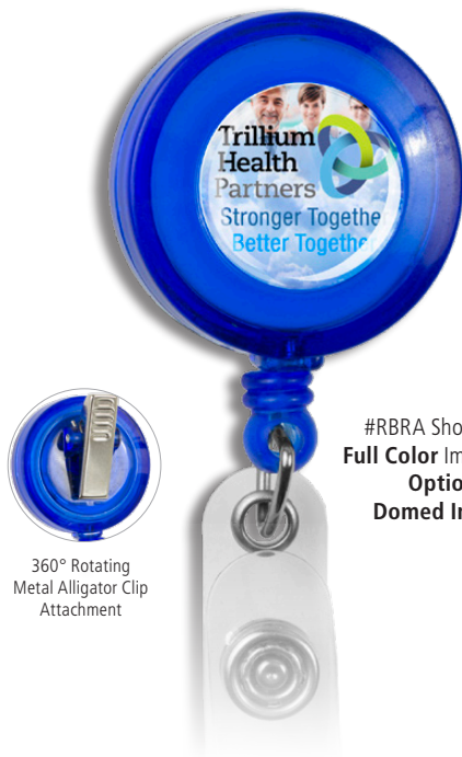
#RBRA Shown with Full Color Imprint* and Optional Domed Imprint

Retractable Badge Reel and Badge Holder with Metal 360° Rotating Alligator Clip Attachment (Spot Color or Full Color Imprint)