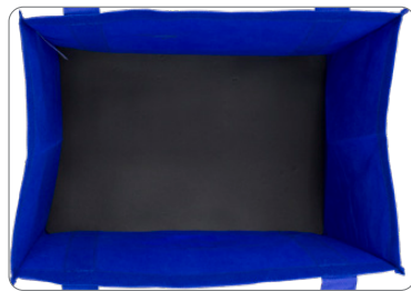
Includes a Black PE reinforced bottom insert